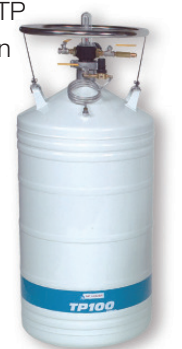
Supply of liquid Nitrogen: TP self-pressurizing vessel